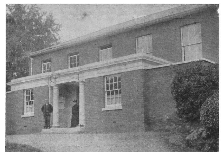
Figure 2: Undated photo of the meeting house ('Friends Meeting House, Dorking', leaflet)